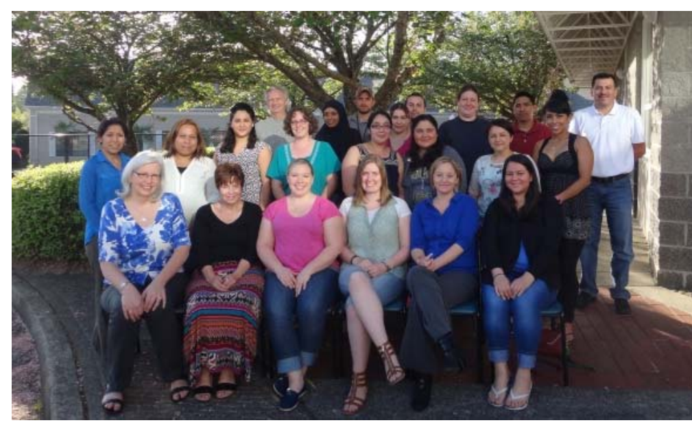
2015-16 Head Start Policy Council

The Head Start Policy Council shares the responsibility of program governance with the Community Action Board of Directors. Policy Council representatives are parents of enrolled children, elected by their peers to represent each program site. Parents who participate develop leadership and advocacy skills and contribute an essential voice to program decisions.