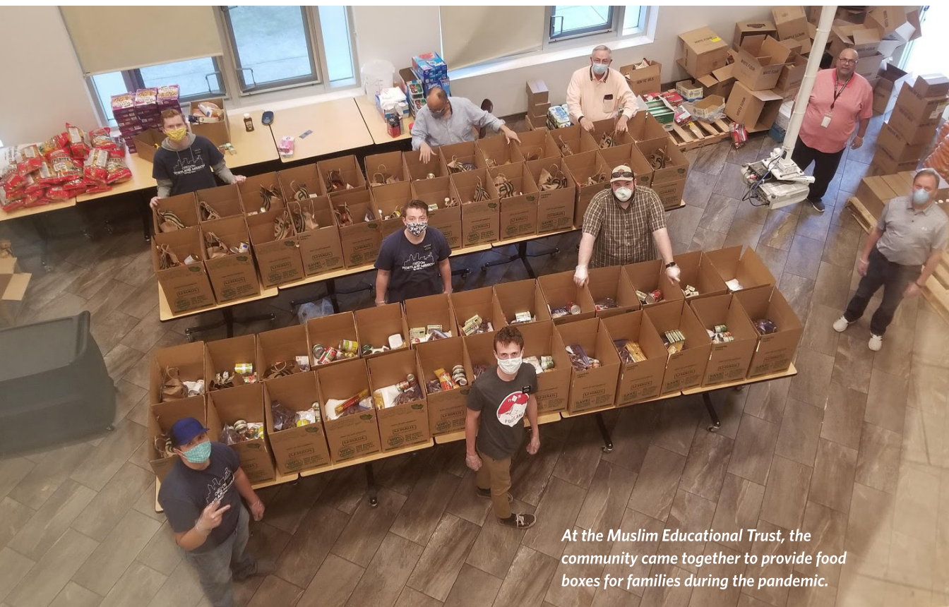
At the Muslim Educational Trust, the community came together to provide food boxes for families during the pandemic.

As the pandemic pummeled the economy for the last two years, families furthest from opportunity due to race, language, and immigration status were being hit hardest.